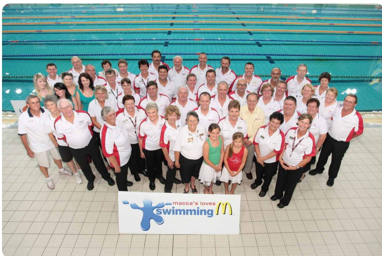
2009 QLD Championships – Officials and Volunteers

Congratulations to all our swimmers, from our little ones just getting into the pool for their very first competition, to those who are now leaving our region to further develop their swimming careers on the National stage. Best wishes to you all for the new season.