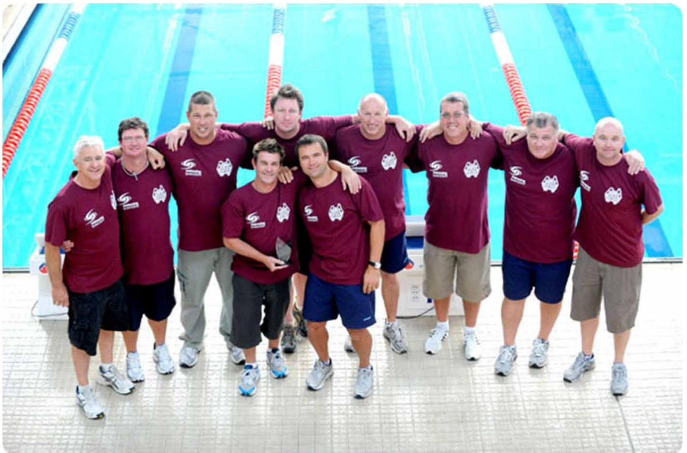
Queensland Team Coaches – State Age Teams Short Course Championships