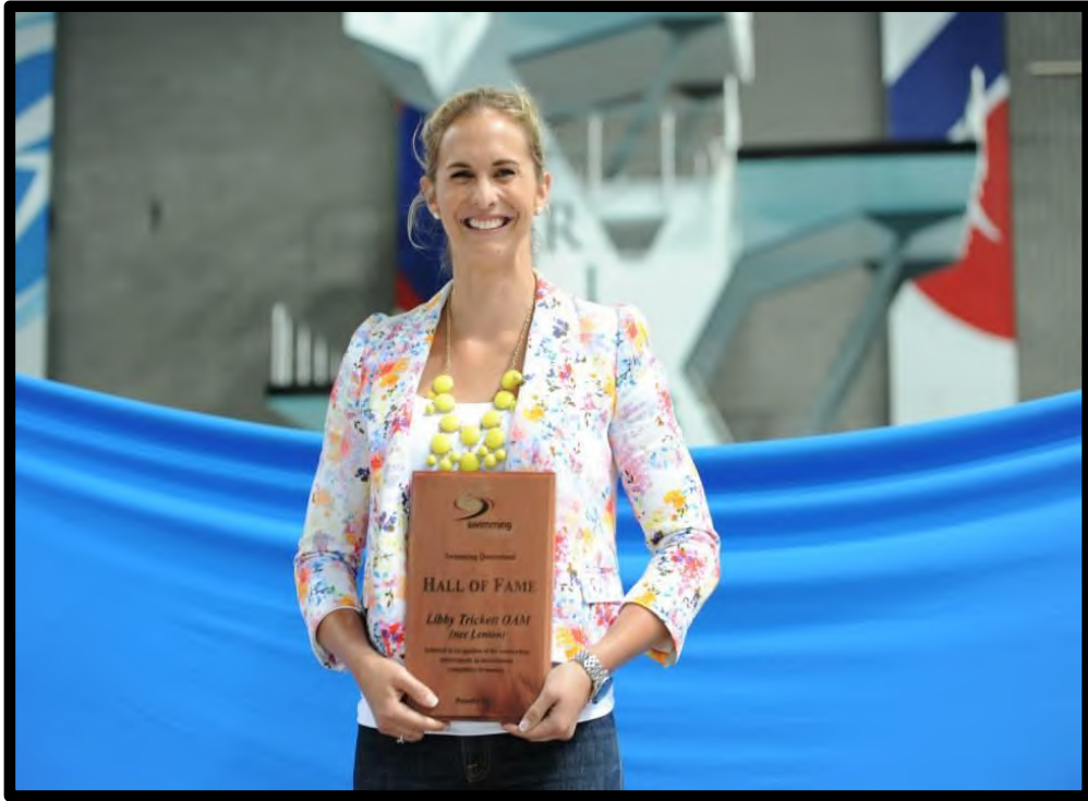
Libby Trickett- Inducted into the SQ Hall of Fame at the Qld Championships