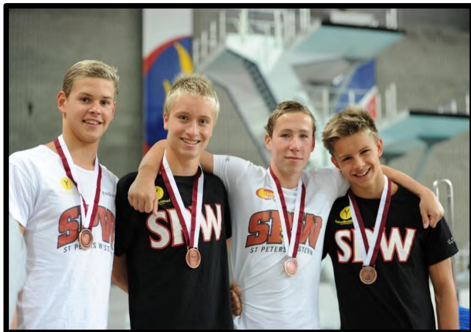
St Peters Western Relay Team - Qld Championships