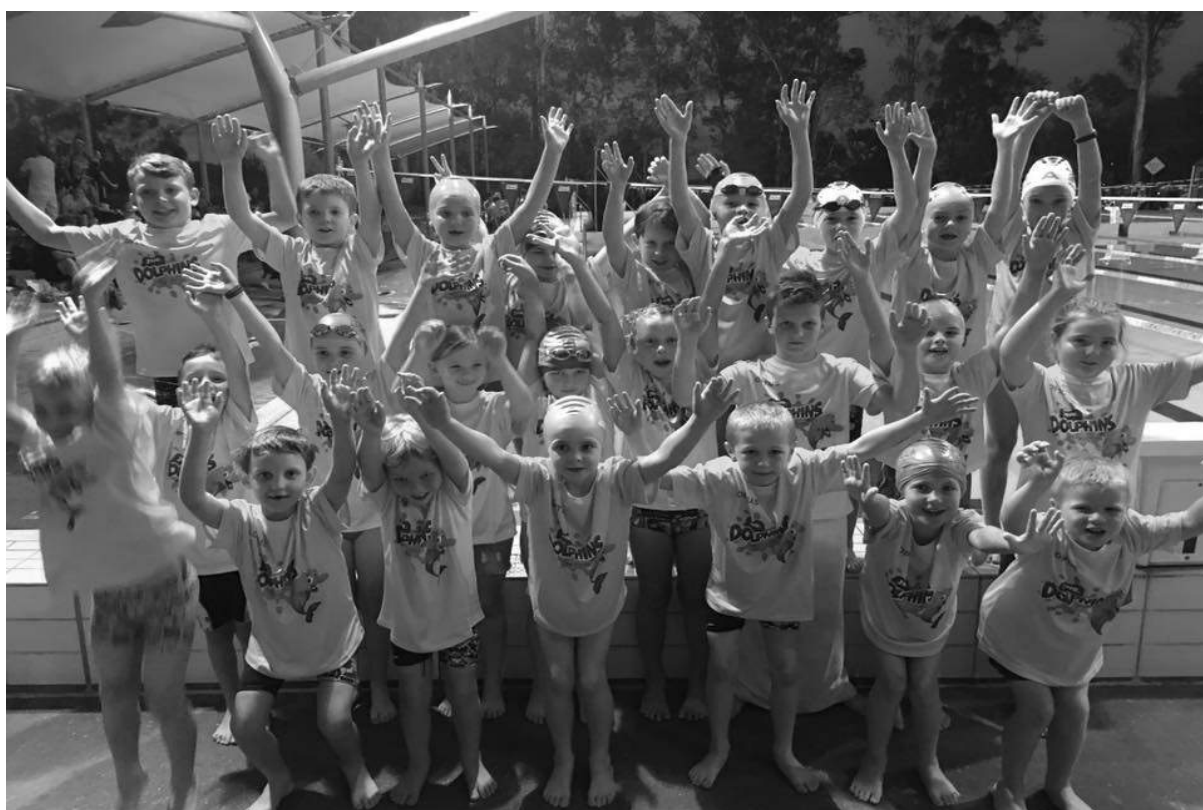
Optus Junior Dolphins – a fantastic initiative for our young swimming members