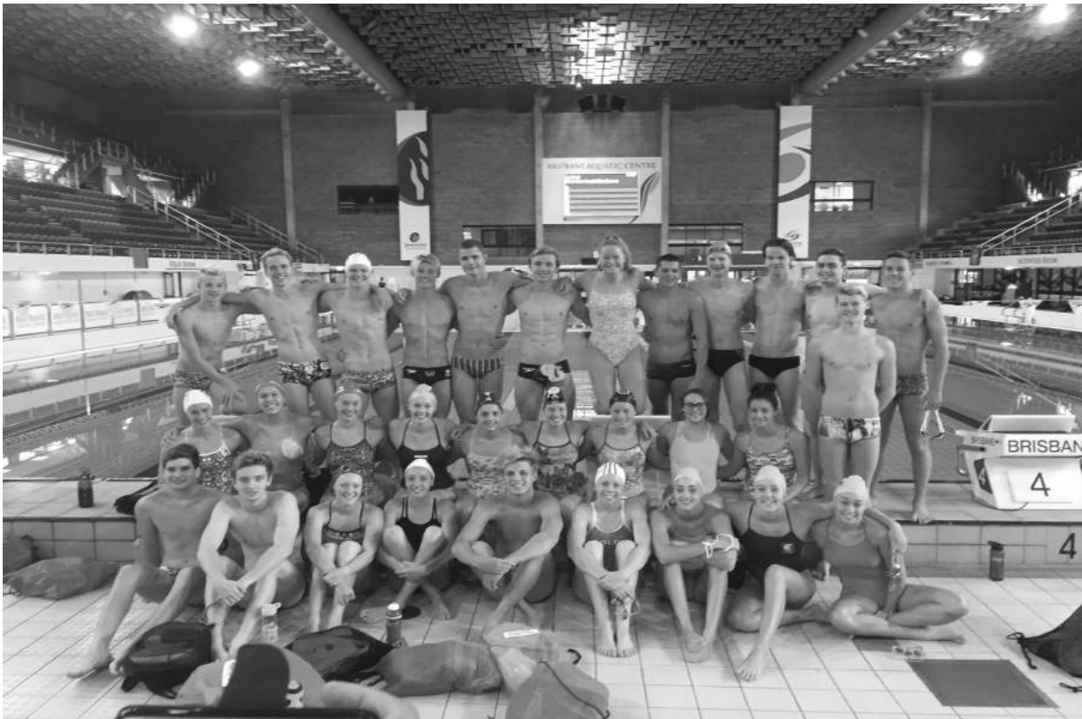
SQ Talent Identification (TID) Camp, January 2017