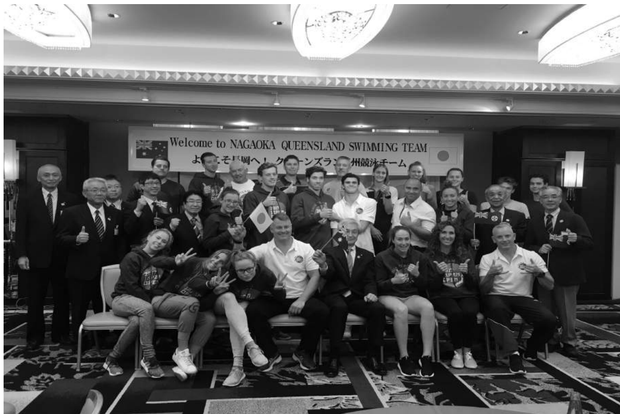
2017 SQ Japan Open Team at their Welcome Celebration in Nagaoka, Japan