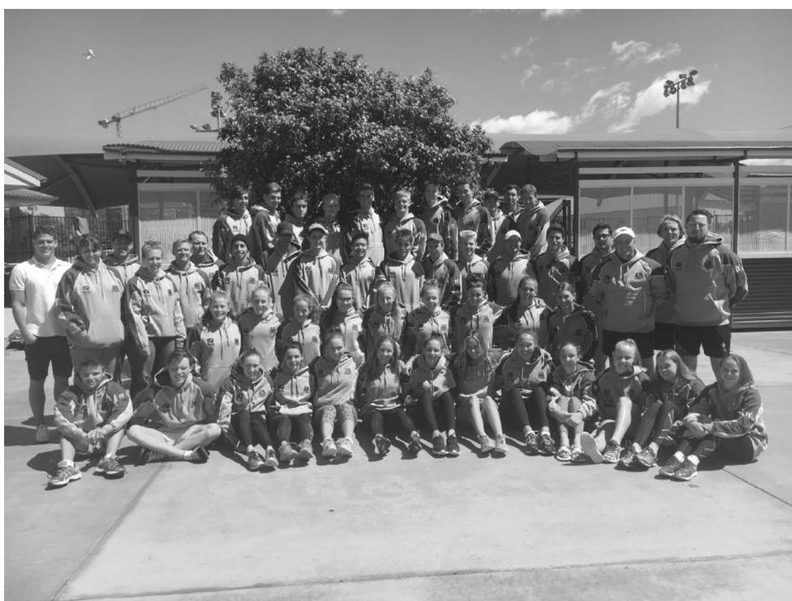
2016 Qld State Teams Championship Team