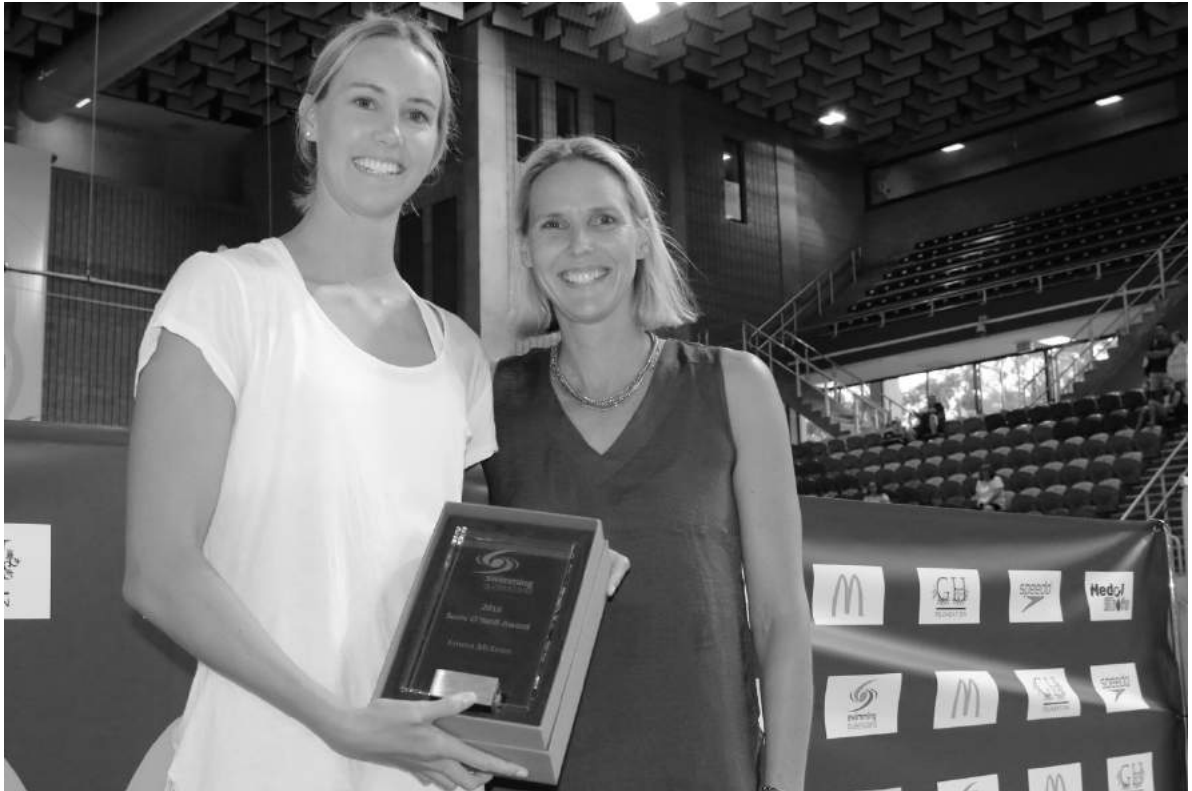
Emma McKeon being presented with the 2016 Susie O'Neill Award by Susie