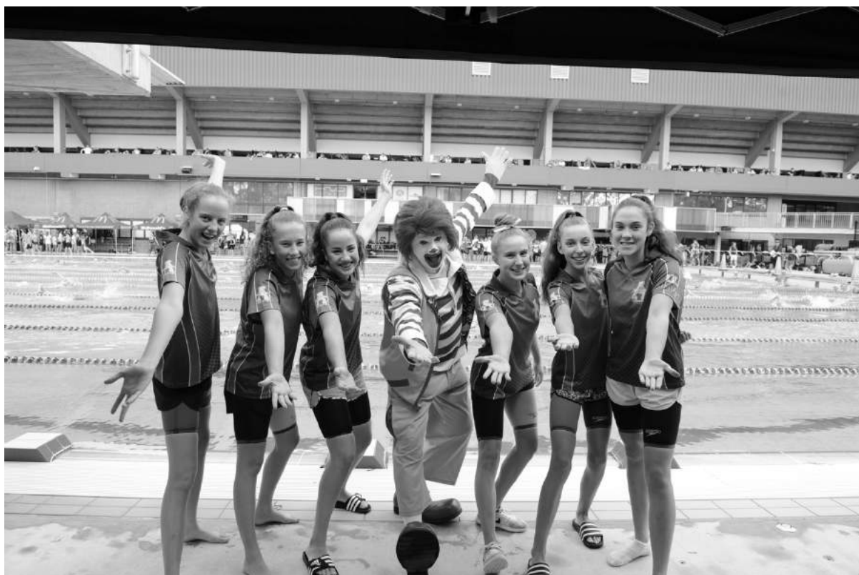
McDonald's – proud sponsor of Swimming Queensland and associated Regions